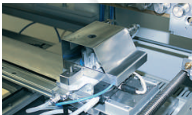
real quantity control for drop jet fluxers

A particular innovative feature of the offline teach program is the passage optimization. After teaching of all solder points the program computes independently the fastest way to minimize handling times. Using the USB interface or network connection, takeover of soldering programs out of the offline teach program into the machine and vice versa is possible fast and trouble-free without further conversions.